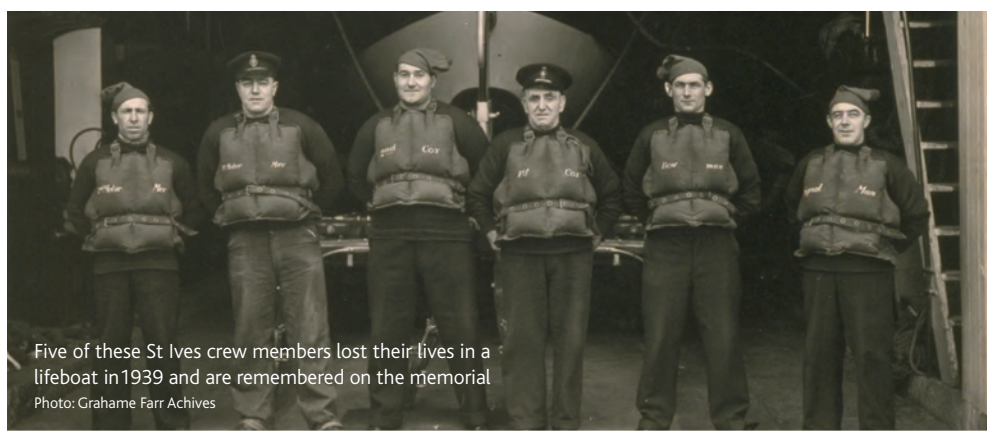
Five of these St Ives crew members lost their lives in a lifeboat in 1939 and are remembered on the memorial